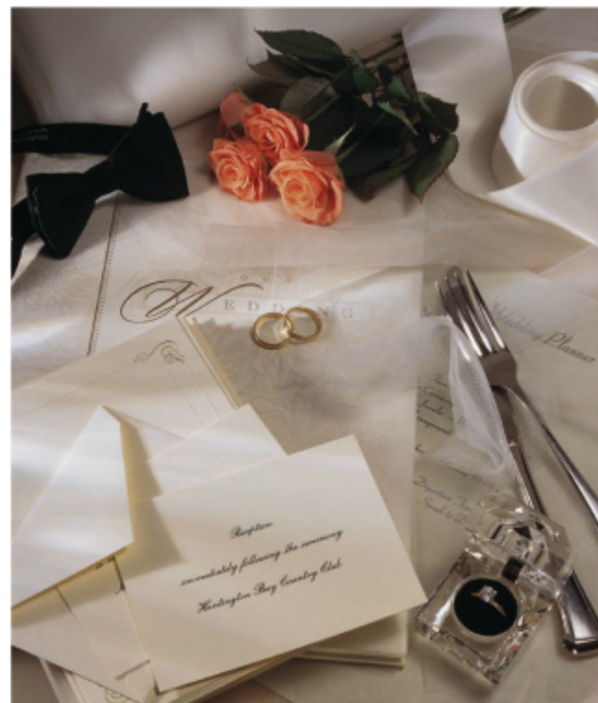
Computer Creations — For Invitation-Only Events Specializing in Addressing, Inserting, and Mailing DFW, 214.904.8455

One final, important reminder to help your wedding run smoothly: make sure each piece mailed has sufficient postage. It would be terribly embarrassing if your invitations and thank-you notes were returned by the post office!